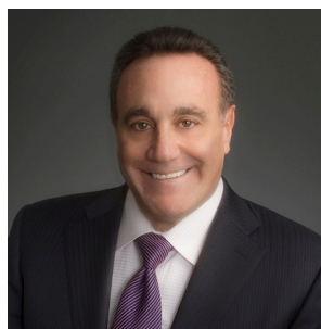
President & CEO of Vector Technical Resources