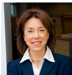
President & CEO of DSK Solutions