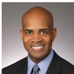
President & CEO of The Burwell Group